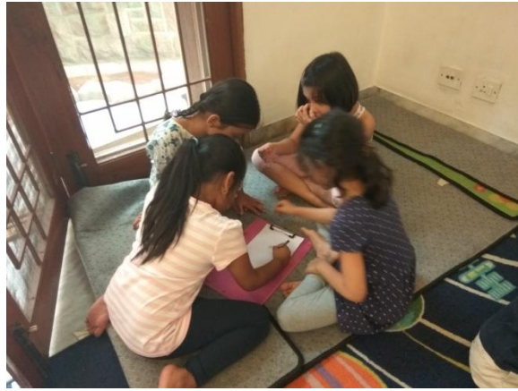
Photo of designing.

Each team had three logos; the challenge was which one was the best. Each group wanted their logo to be chosen. The thought of collaborating or choosing the best features out of all the logos to make a new one, had not crossed their mind.